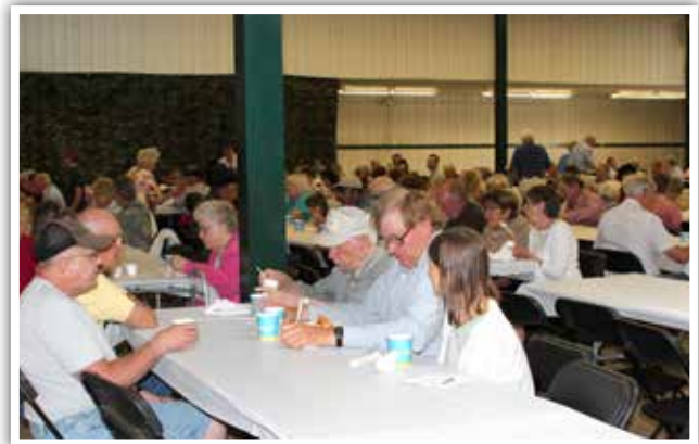
Members enjoy a meal before the annual meeting.

The Annual Members Meeting of Polar Communications was held on Thursday, June 7, 2018. A total of 162 members registered during the meeting. Members and guests were served a meal of BBQ pork, baked beans and coleslaw prior to the meeting.