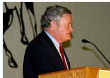
Lt. Governor Jack Dalrymple addresses the members.

The Annual Members Meeting of Polar Communications was held on Thursday, June 10, 2010. A total of 309 members registered during the meeting. Members and guests were served a meal prior to the meeting.