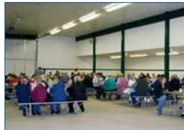
Members enjoy a meal before the meeting.