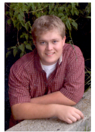
Kevin Cushing (Not Pictured - Kurt Carpenter)